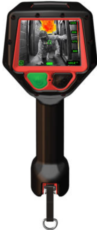
AttackPRO Kit: FQ-PAEX 5yr Enhanced Warranty: WA-5USATTACKPRO

Designed with firefighters for firefighters, the AttackPRO™ thermal imaging camera offers an unmatched combination of image quality, durability, and price.