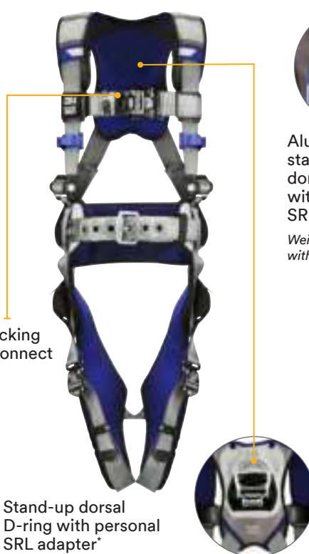
3M™ DBI-SALA® ExoFit™ X200 Harness