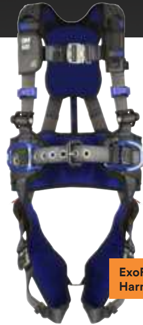
ExoFit™ X300 Harness