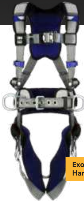
ExoFit™ X200 Harness