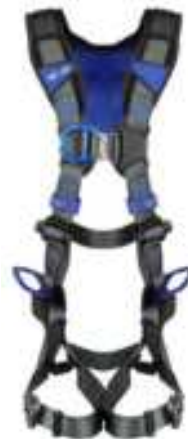
Climbing/Positioning (Wind Energy)*