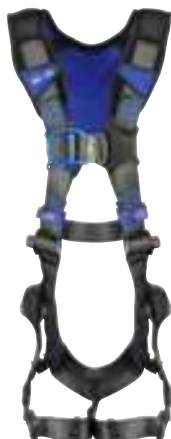
General Industry Climbing*