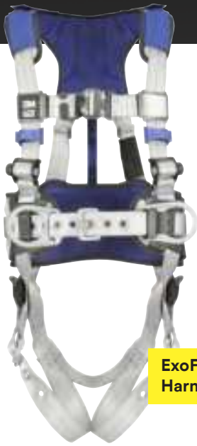
ExoFit™ X100 Harness